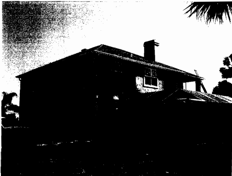
REAR VIEW 5/6/2008