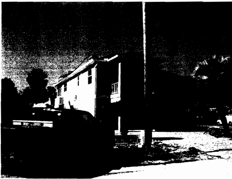
FRONT VIEW 5/6/2008

If using the Elevation Certificate to obtain NFIP flood insurance, affix at least two building photographs below according to the instructions for Item A6. Identify all photographs with: date taken; "Front View" and "Rear View"; and, if required, "Right Side View" and "Left Side View." If submitting more photographs than will fit on this page, use the Continuation Page, following.